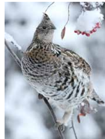
Ruffed Grouse by Ken Whitten

The 2019 Fairbanks Christmas Bird Count took place on December 14, and it was a remarkable day in many ways. One hundred fourteen people spent the day watching their feeders and driving, hiking, skiing, snow-shoeing, and dog-sledding the count circle to find 30 species and 4,622 birds total.